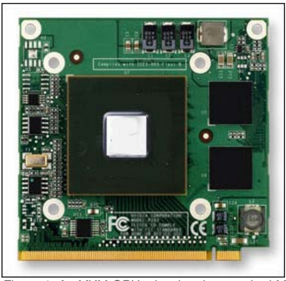
Figure 1. An MXM GPU, showing the standard MXM connector pins at the bottom edge.

Upgrading a notebook design to allow an add-in graphics module is a bit tougher than simply adding in more memory, as the cooling of the module must be addressed. However, the notebook manufacturer can reduce the number of different motherboards that need to be designed and inventoried. Thus, the particular graphics desired by the consumer can be addressed at the time of final assembly. In many cases, a retailer or distributor can add in the requested module just before the consumer receives the laptop, thereby reducing lag time and the possibility of losing a sale because the unit has the wrong graphic capabilities for the customer's needs.